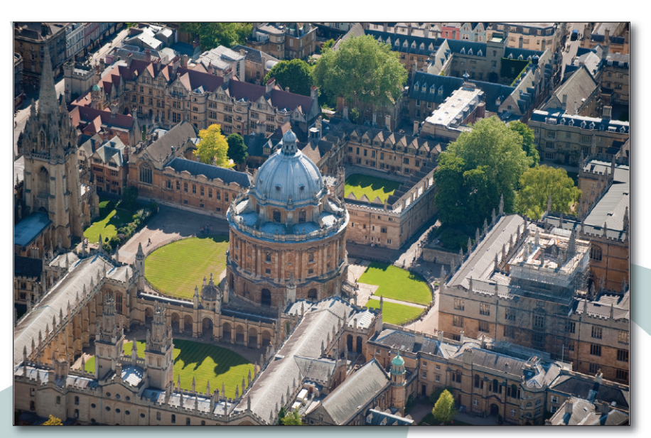
Radcliffe Square sits in the centre of the city of Oxford surrounded by historic Oxford University college buildings.