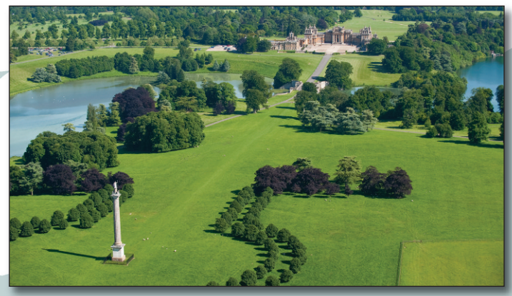
Right: The magnificent Blenheim Palace is a unique example of English Baroque architecture.