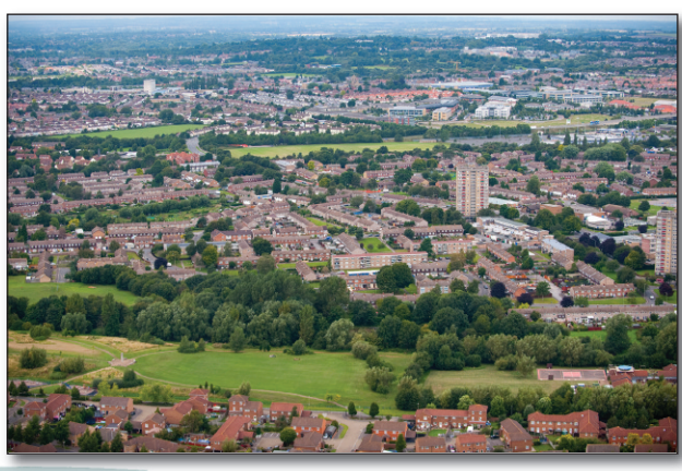
A panoramic view over Cowley, one of the major suburbs of Oxford.