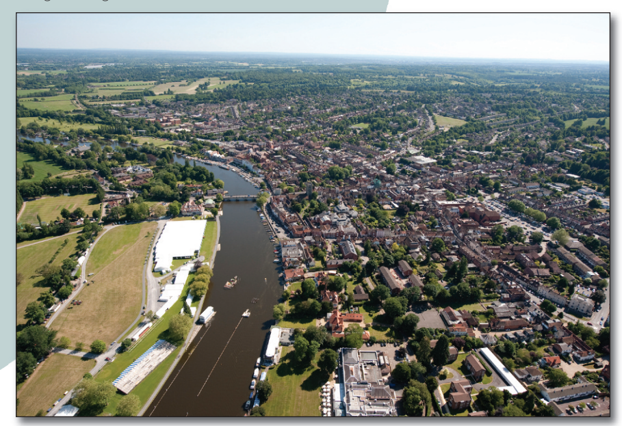
Henley-on-Thames during the construction of the marquees for Henley Regatta, held annually in early July. It was first held in 1839 and since has become the world's premier event of its kind.