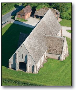
The vast thirteenth century Tithe Barn at Great Coxwell is now in the care of the National Trust.